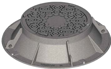
Illustrated 1805Z1VH 10" ductile iron frame with 1805 Type A7 ductile iron cover