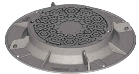
1802Z1 5 5/8" frame with 1805 Type A7 cover