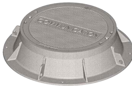
Illustrated 1825Z 10" frame with 1810 Type A2 cover